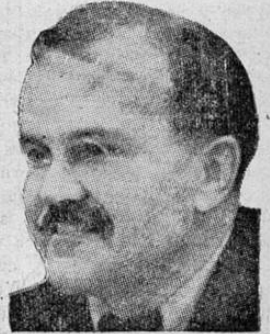
SOVIET MINISTER Molotov who presented Union's Reorganization Scheme

The sixteen individual republics will, henceforth, be at liberty to maintain their own armed forces and direct their individual foreign affairs. It is expected, in diplomatic circles, that the change will present a number of problems for the United Nations in their post-war programme.