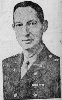
GENERAL CLARK in Command of the Fifth Army

A subsequent advice states Cassino has been taken by the Fifth and a large number of prisoners captured.